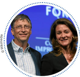
BILL AND MELINDA GATES

Artists and philanthropists from all around the globe joined, including: